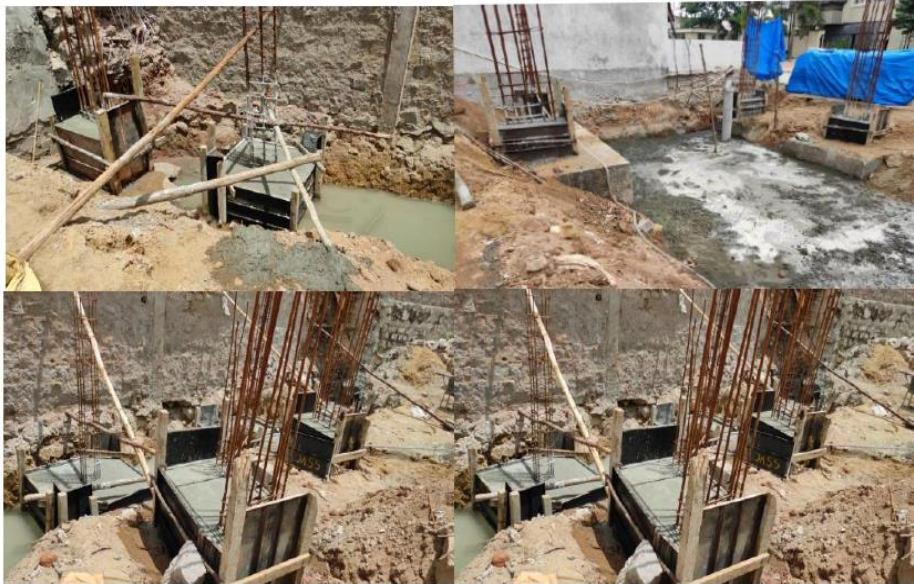
▪ Under construction Development project