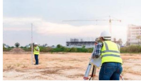
▪ Land Survey,