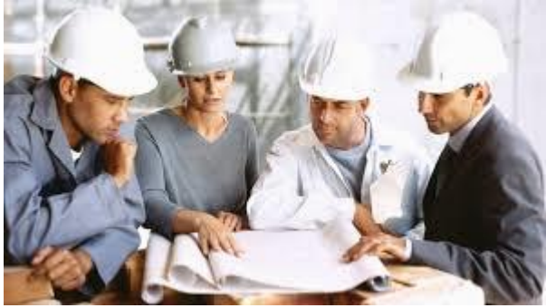
▪ Civil Engineering,