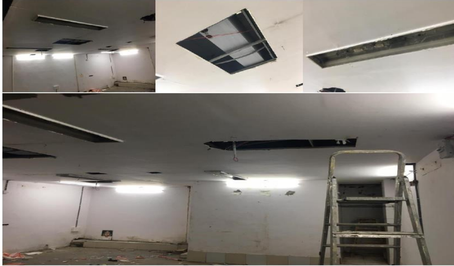
▪ Before office Renovation