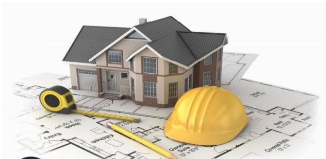
▪ Architectural Designs,