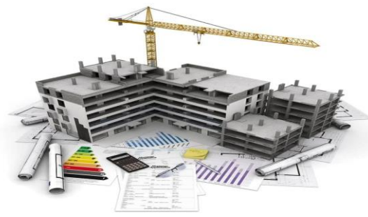
▪ Structural Designs,