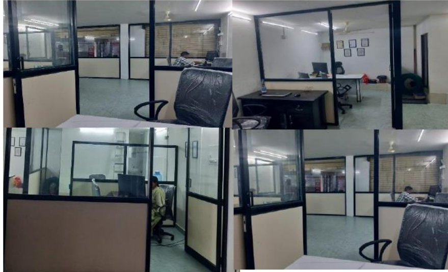
▪ After office Renovation