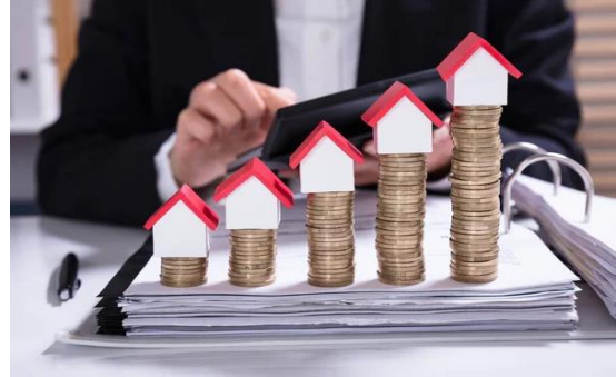
▪ Property Valuation ,