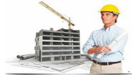
▪ Development ,