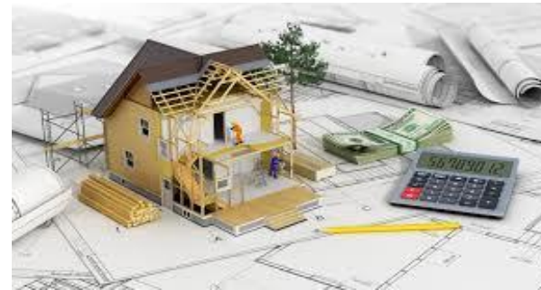
▪ Estimations ,